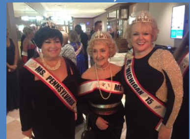
The middle lady is from the UK... she is amazing!