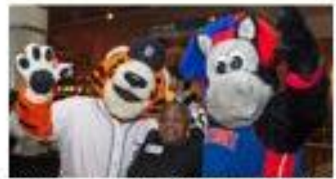
This is what thriving looks like! Whoo hoo!

Almost 20% of the state's population is 65 or older. Michigan has moved from the 30<sup>th</sup> oldest state in the USA to the 10<sup>th</sup> oldest.