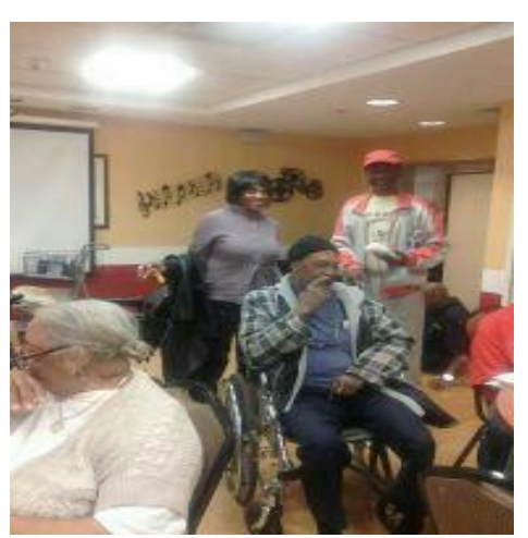
Resident's Celebrating during the Holiday Season