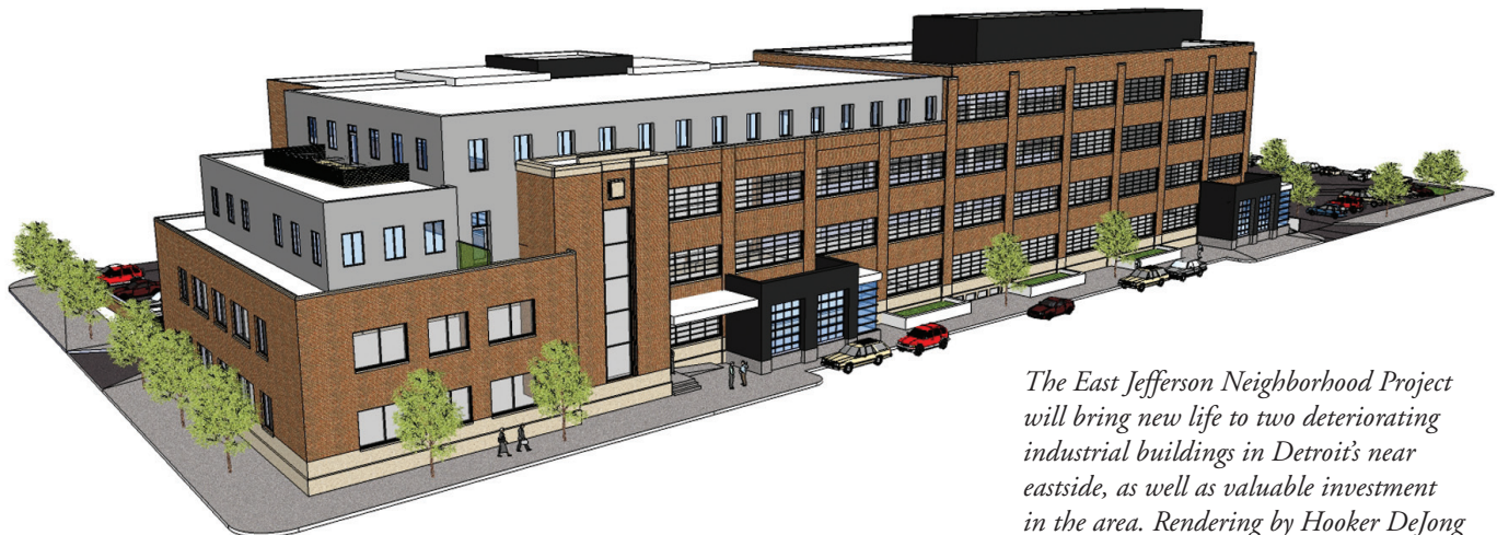
The East Jefferson Neighborhood Project will bring new life to two deteriorating industrial buildings in Detroit's near eastside, as well as valuable investment in the area. Rendering by Hooker DeJong Architects & Engineers