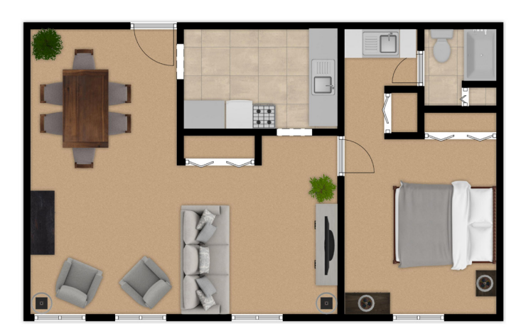
Great Room 864 sq.ft. Includes dishwasher and microwave