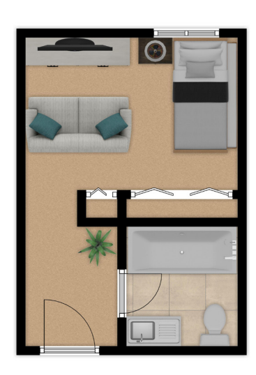
Studio 260 sq. ft.