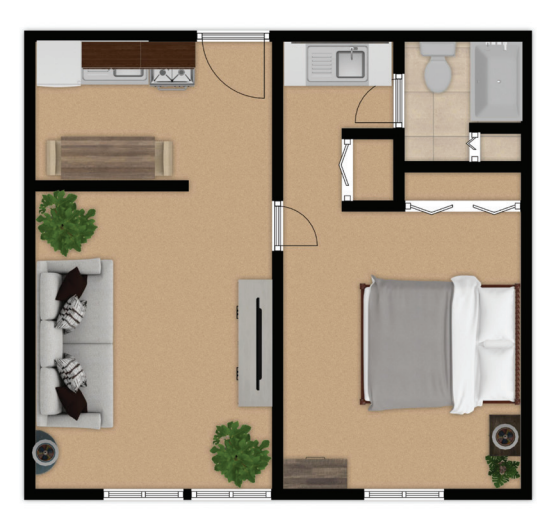
One Bedroom 532 sq. ft. Barrier free is available