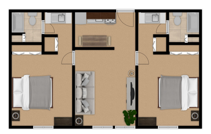
Two Bedroom/Two Bath 864 sq. ft. Barrier free is available