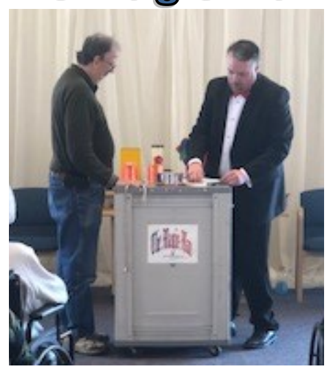
Making Valentine Soap