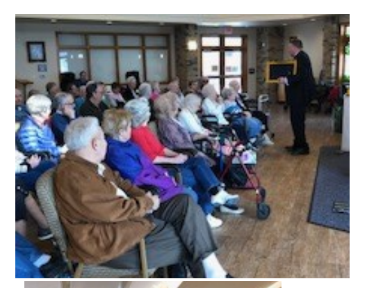
Valentine's Day Party