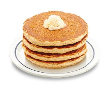
<u>Free</u> <u>Pancake Lunch!</u>

Meet the Administrator Meeting December 17 11:00 AM at SMII 2:00 PM at SMI