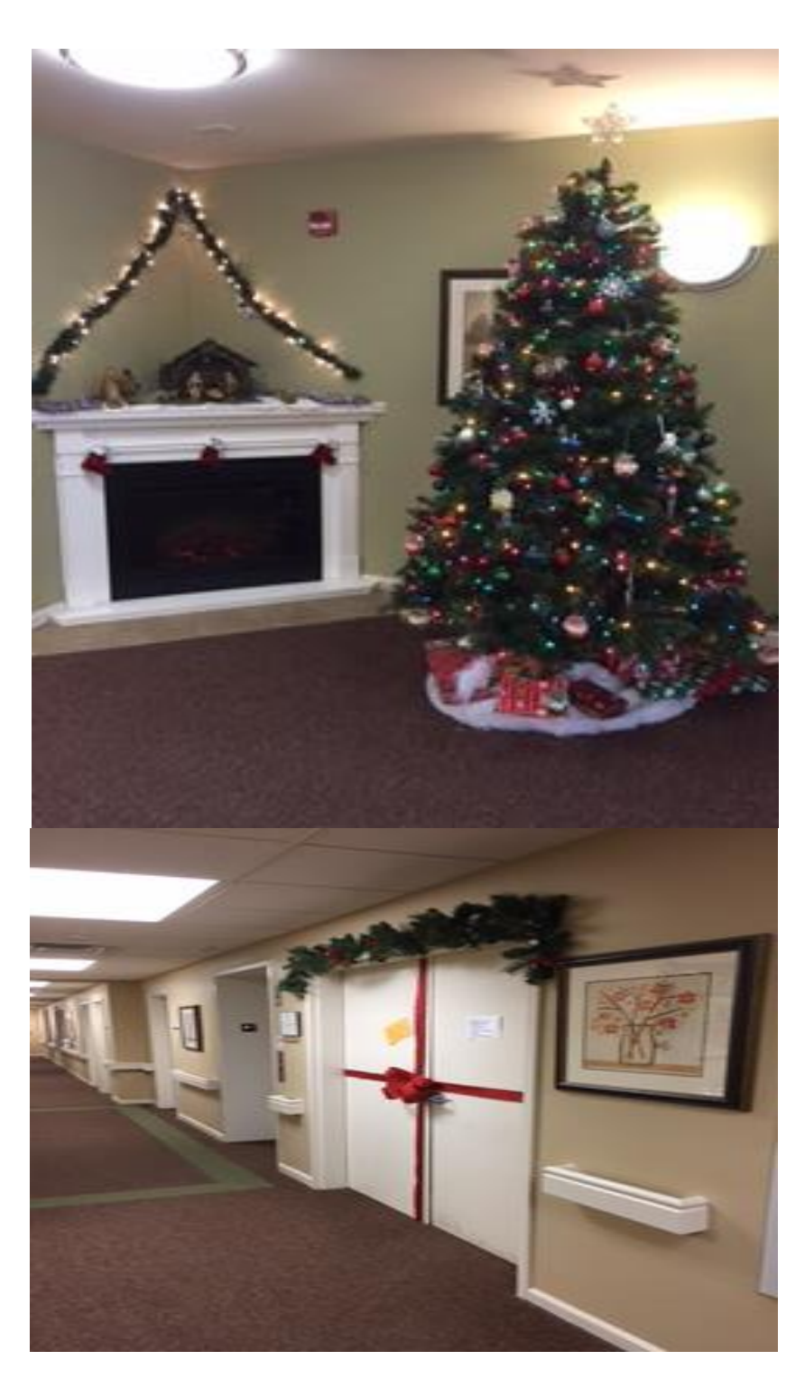
Happy Holidays from our Village to yours...