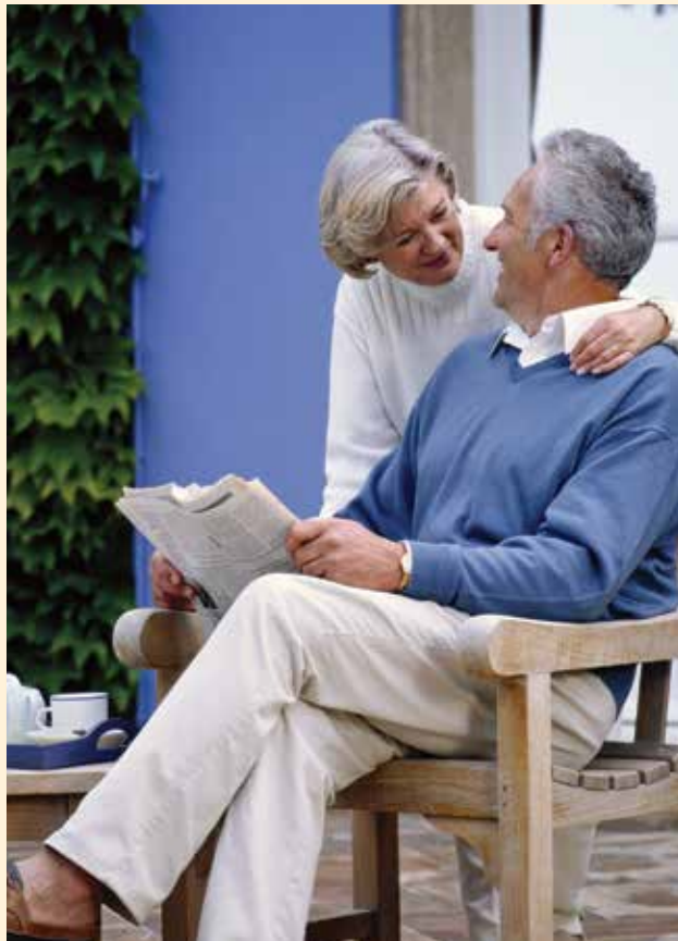
The Village of Holly Woodlands

Each apartment has wall-to-wall carpeting throughout, a beautiful combined living/dining room area, individual patios, optional washer/dryer hook-ups, full kitchen with electric range and refrigerator/freezer, as well as air conditioning hook-ups.