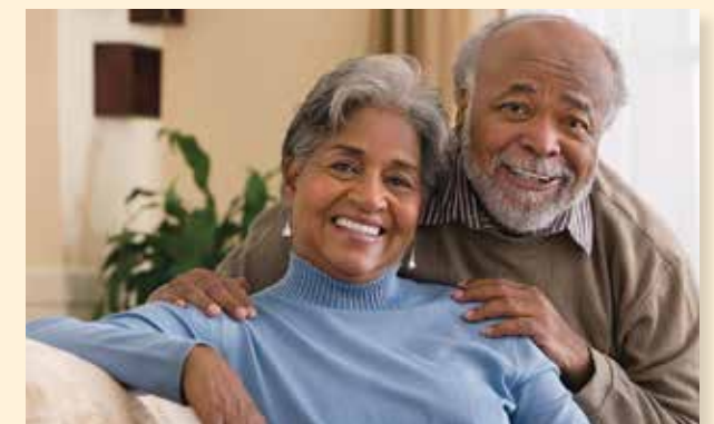
For more information: 248.634.0592 | www.pvm.org