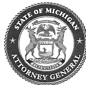
Bill Schuette, Attorney General