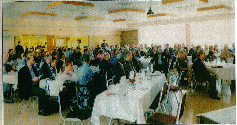
A good crowd showed up to hear the speech.

Proceeds from the $20 per person luncheon at The Village of Redford — which provided the hall and food without charge — were donated to the Partnership for a Better Redford, an effort organized by the South Redford and Redford Union school districts and the township to cooperate on mutual problems and find ways of improving the community.