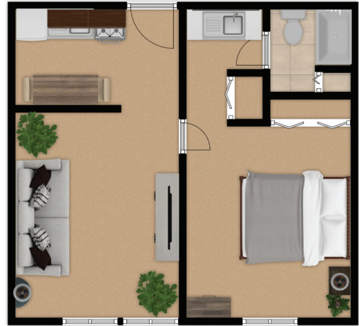
One Bedroom 532 sq. ft. Barrier free is available