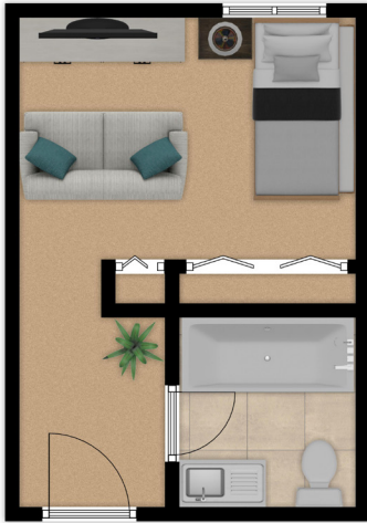
Studio 260 sq. ft.