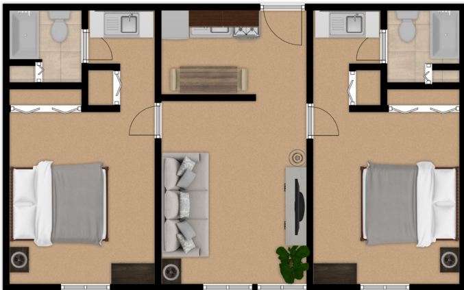
Two Bedroom/Two Bath 864 sq. ft. Barrier free is available