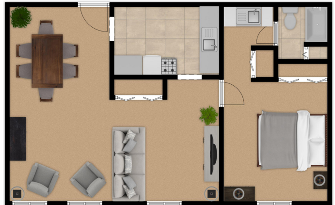
Great Room 864 sq.ft. Includes dishwasher and microwave